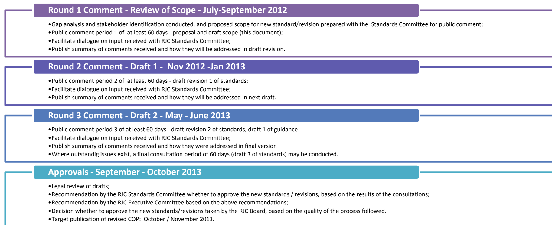
Figure 1 – Proposed Code of Practices revision timeline

Figure 1 below outlines the proposed timeline for the Code of Practices revision. The target conclusion date is October / November 2013.